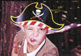
50 Free Family Activities!