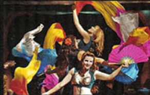
16 Stages of Entertainment!