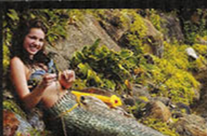
New Attractions in 2013!