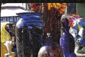
250 Artisans for Shopping!