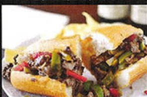
Food fit for a King!