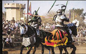
Live Armored Jousting!