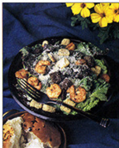
BLACKENED SHRIMP CAESAR SALAD: Crisp Romaine lettuce served with blackened shrimp, fresh vegetables, grated Parmesan and secret dressing.