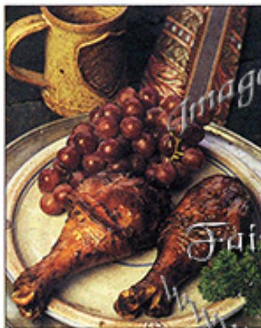
TURKEY LEGS: Dripping with sauce and cooked to perfection, this Festival favorite allows everyone to eat like King Henry!