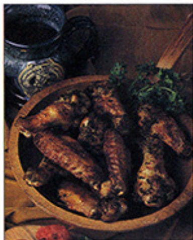
HERB ROASTED WINGS: Succulent buffalo wings slowly roasted in a bath of butter and herbs. This is remarkable as a meal in itself or as just an appetizer for the truly hungry.