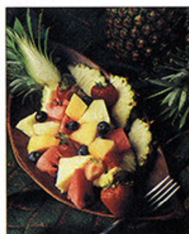
PINEAPPLE FRUIT MELANGE: A large tropical pineapple halved and filled with fresh strawberries and melon chunks then sprinkled with blueberries.