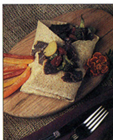
TERIYAKI STIRFRY: This Oriental feast is a beef teriyaki stirfry served in a honey wheat wrap.