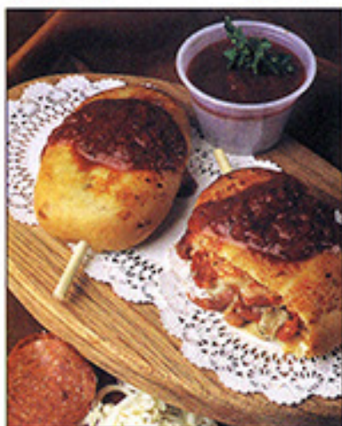
PIZZA ON A STICK: A stuffed pizza brimming with mozzarella cheese and toppings served with pizza sauce.