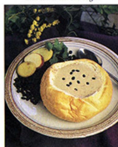
SOUP BOWL: An edible bowl of delightfully crusty bread, served brimming with a tempting choice of creamy potato, cheese or spicy chili.