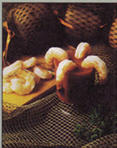
Shrimp Wreck: A vessel of seasoned tomato juice garnished with a school of mouth-watering shrimp. ▲