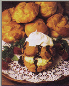
Cream Puffs: A delicate French pastry filled with a light vanilla or chocolate cream. ▲