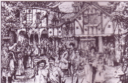
May 1992-93

We bid you welcome and remind you that his royal majesty, King Henry, has declared: "ALL FOR FUN, AND FUN FOR ALL!"