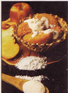
Enchanted Peaches: Delicious breaded peach wedges, fried to a golden brown, and served with a lush sour cream dipping sauce.