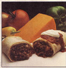
Seville Sandwich: The Spanish are notoriously hot-blooded, perhaps because of foods such as this. Under its zesty sauce you will discover a majestic blend of beef and cheeses wrapped in a flour tortilla and topped with sour cream.