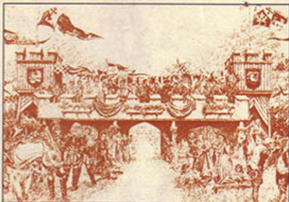
shop 842-843

Thus with anticipation, we bid you welcome, and encourage you to discover the legend that is the Minnesota Renaissance Festival.