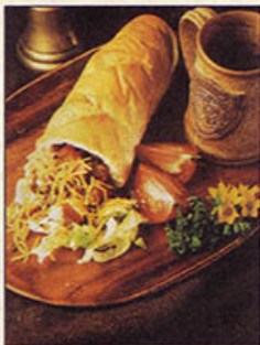
Galleon Sandwich: Tangy chicken salad loaded into a fresh, hoagie bun "hull."