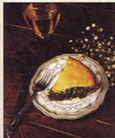
Jean-Luc's Spinach Pie: Taste the special combination of masterful french pastry outside... a richly satisfying filling of creamy spinach and cheese inside. Hearty enough for a peasant, pleasing enough for a King!