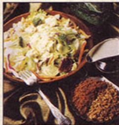
◀ Queen's Greens Salad: Ye Olde Scotch Egg Shop is proud to continue serving the "Queen's Greens" – a salad composed of mixed greens, diced cauliflower, broccoli, parmesan cheese and Sir Mike's specially blended dressing. Cool, crisp and refreshing!