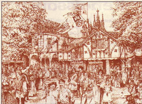
Illustration by A. Bruce Loesch; shop 842-843

The Renaissance movement was inspired by a more secular spirit—less religious—than that of the dark ages. People began to develop a new interest in classical civilization. Laymen and princes encouraged and expected people to learn about poetry, art, literature, and practice in the ways of chivalry. As these new ideas spread throughout Europe, there was a separation from medieval thinking and a re-birth of creative thought, a renewal of classical art, and a revival of classical literature and architecture.