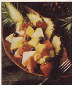
Pineapple Fruit Melange: A large tropical pineapple halved and hollowed then filled with fresh ripe strawberries & melons, and sprinkled with blueberries.