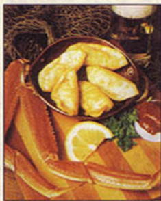
Crab Rangoon: Egg roll skins filled with crabmeat, cream cheese, water chestnuts, crispy vegetables, and authentic spices.