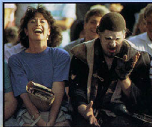
Enjoy 8 stages of "breath-taking" entertainment!