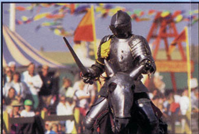
Witness courageous knights battle for the glory of victory!