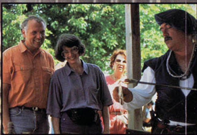
Watch, listen and discover age-old secrets of artisans!