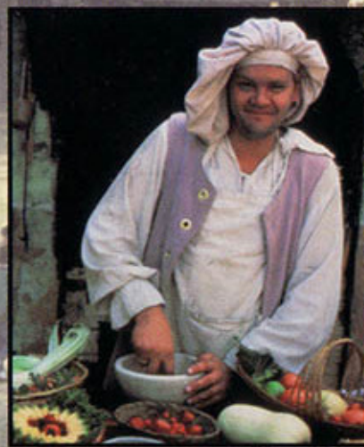
Savor the flavor of far away treats!