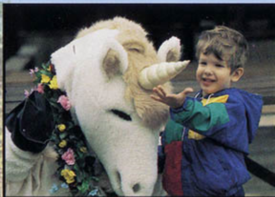
Capture heartwarming moments and memories!