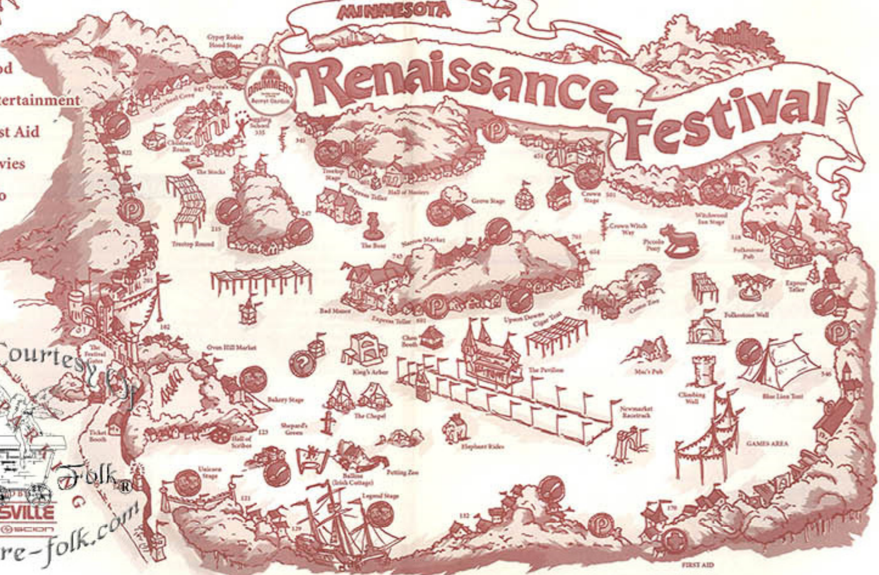
PROUDLY BY BURNSVILLE TOYOTA SCION www.faire-folk.com